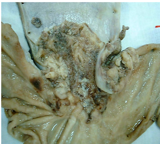
Figure 1 - Gross examination of resected specimen shows ulcerated carcinoma in the lower esophagus and gastric cardia

These two tumors collided at the EGJ, but there was no intermingling (Figure 2). There were neoplastic emboli in lymphatic vessels and perineural invasion, besides metastatic adenocarcinoma in two right cardinal lymph nodes and metastatic SCC in two other right cardinal lymph nodes.